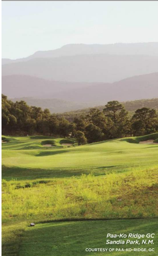
Paa-Ko Ridge GC Sandia Park, N.M.