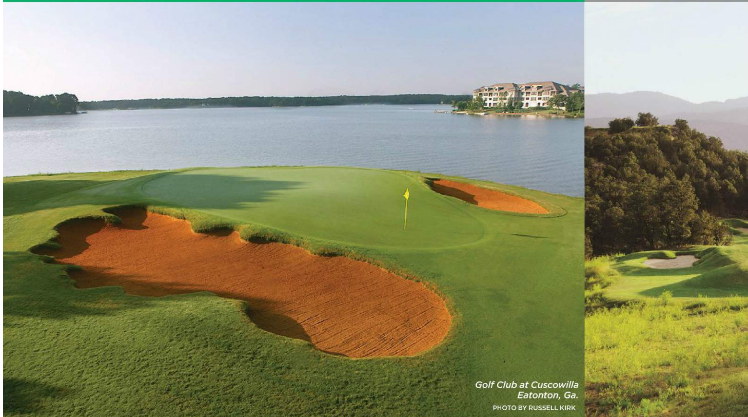
Golf Club at Cuscowilla Eatonton, Ga.